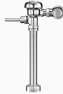
Variation Not Shown: 2" Offset